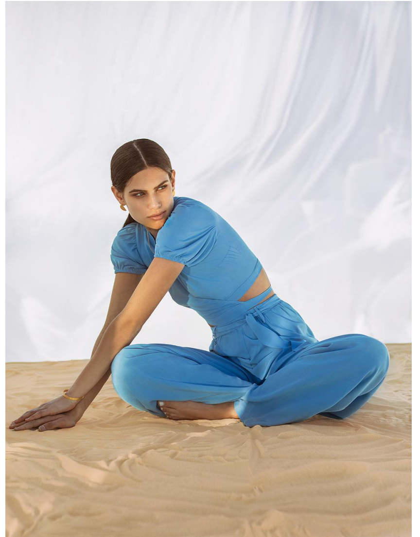
Thalia top & Electra pants