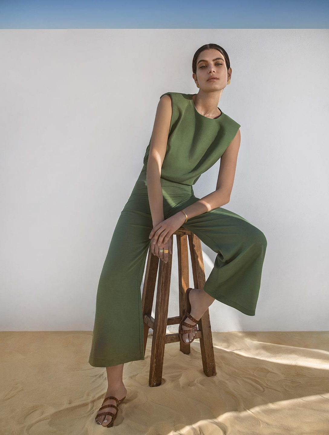
Aspasia top & Ariana pants