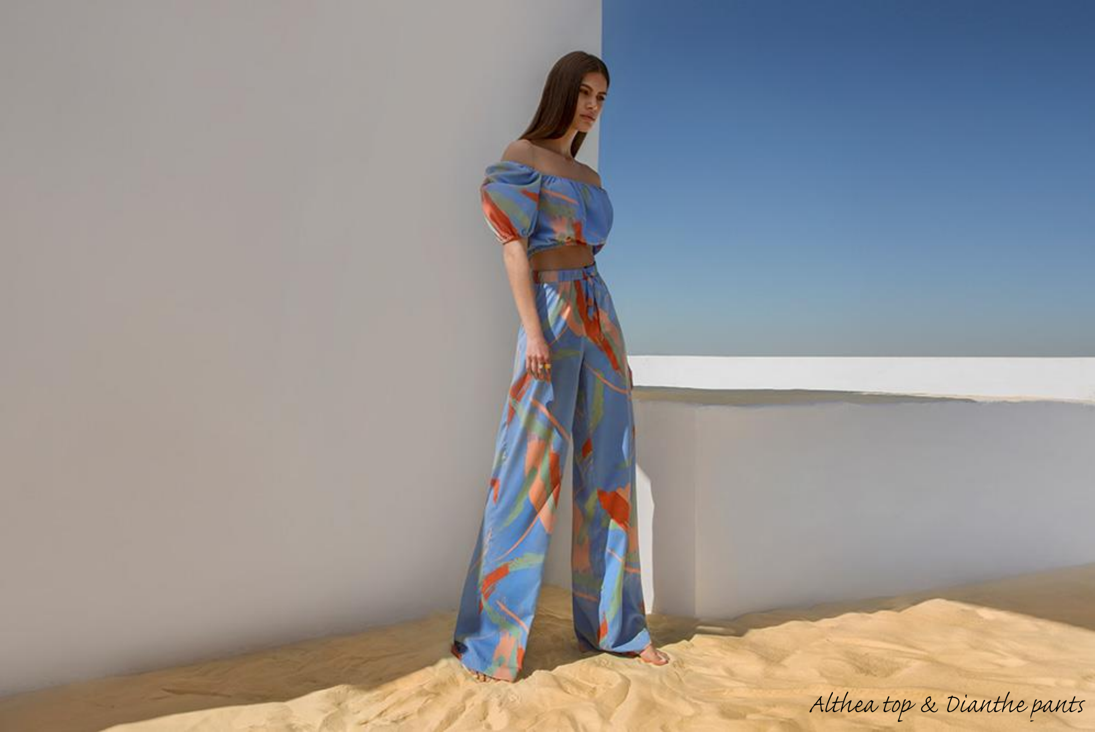
Althea top & Dianthe pants